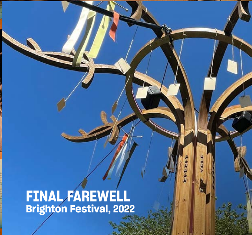
FINAL FAREWELL Brighton Festival, 2022