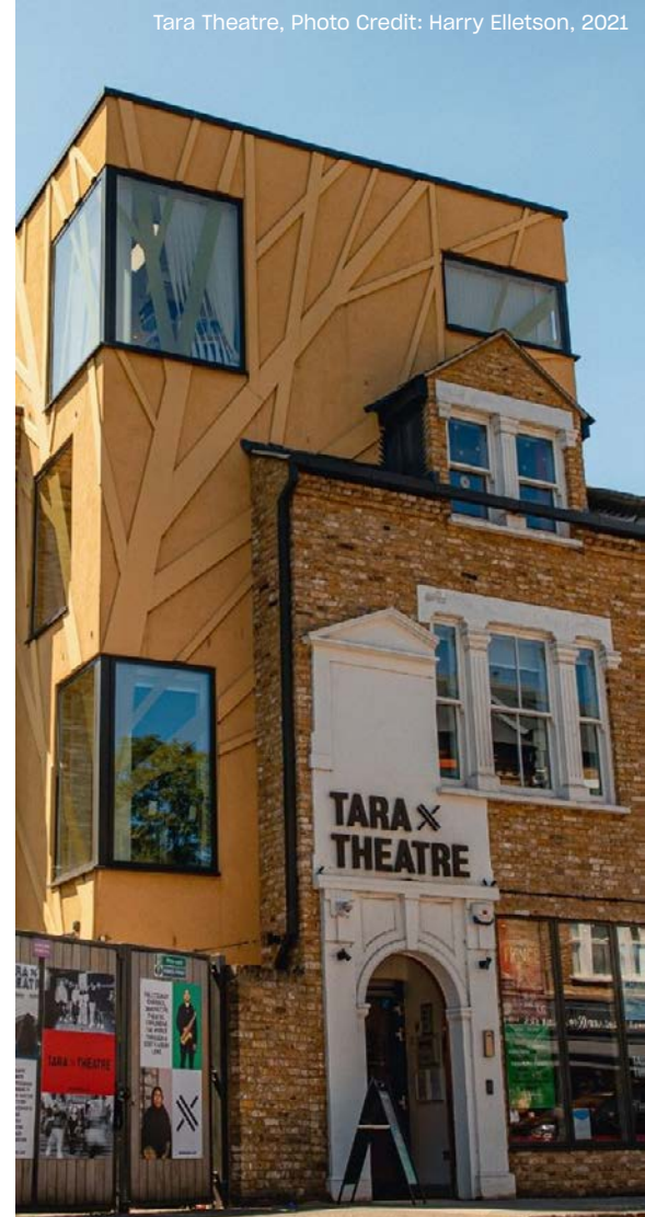
Tara Theatre, Photo Credit: Harry Elletson, 2021

Tara Theatre is supported using public funding by Arts Council England, Greater London Authority and Wandsworth Borough Council.