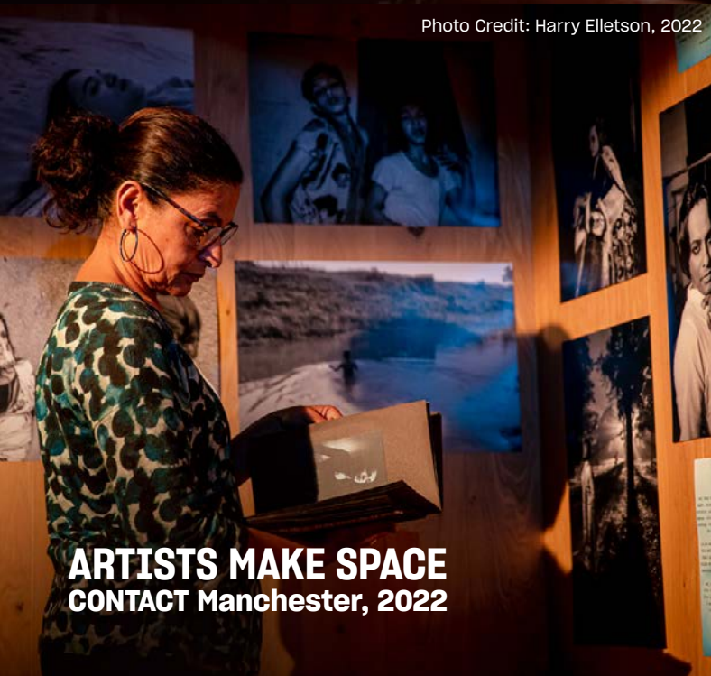
ARTISTS MAKE SPACE CONTACT Manchester, 2022