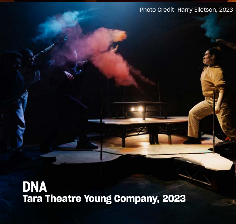
DNA Tara Theatre Young Company, 2023