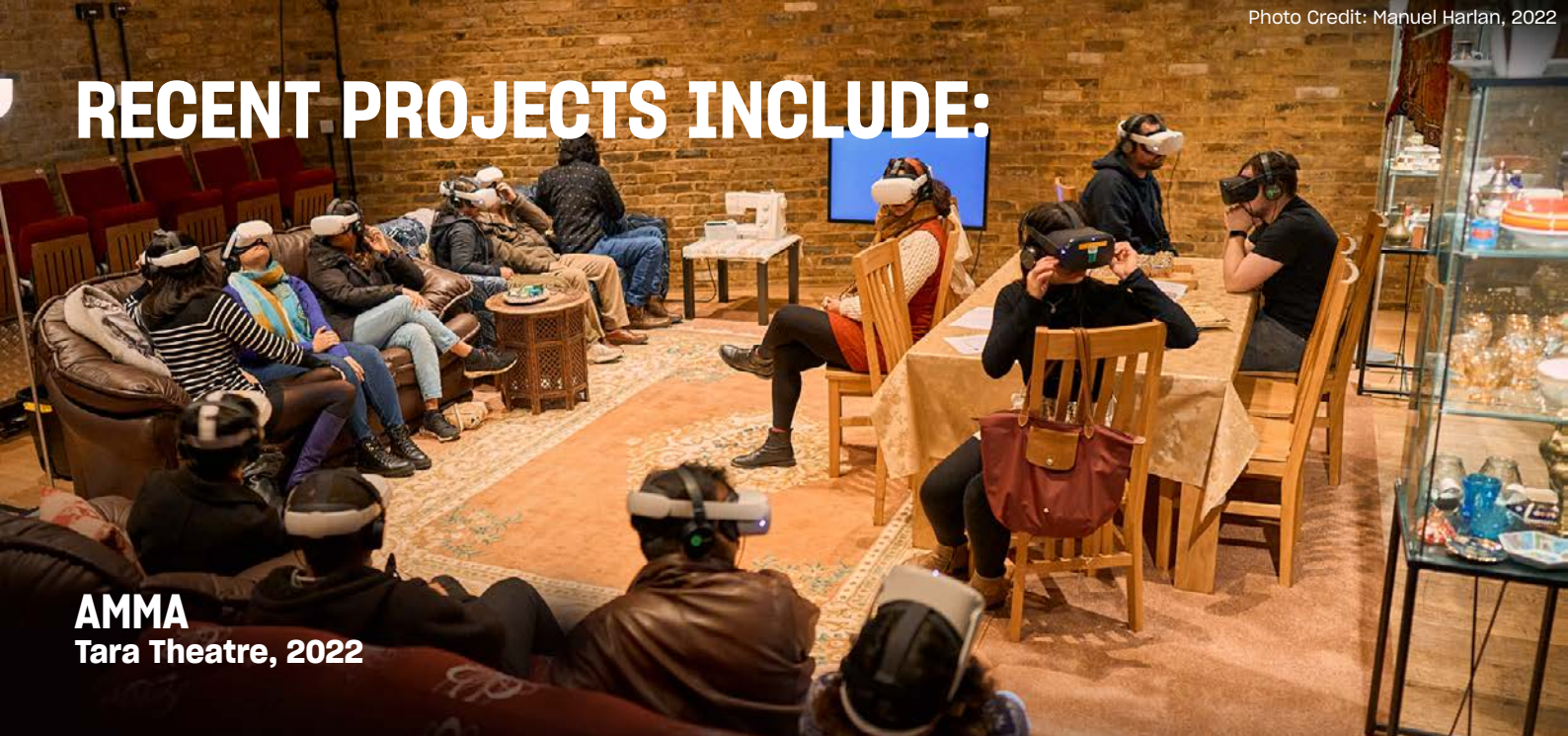
AMMA Tara Theatre, 2022