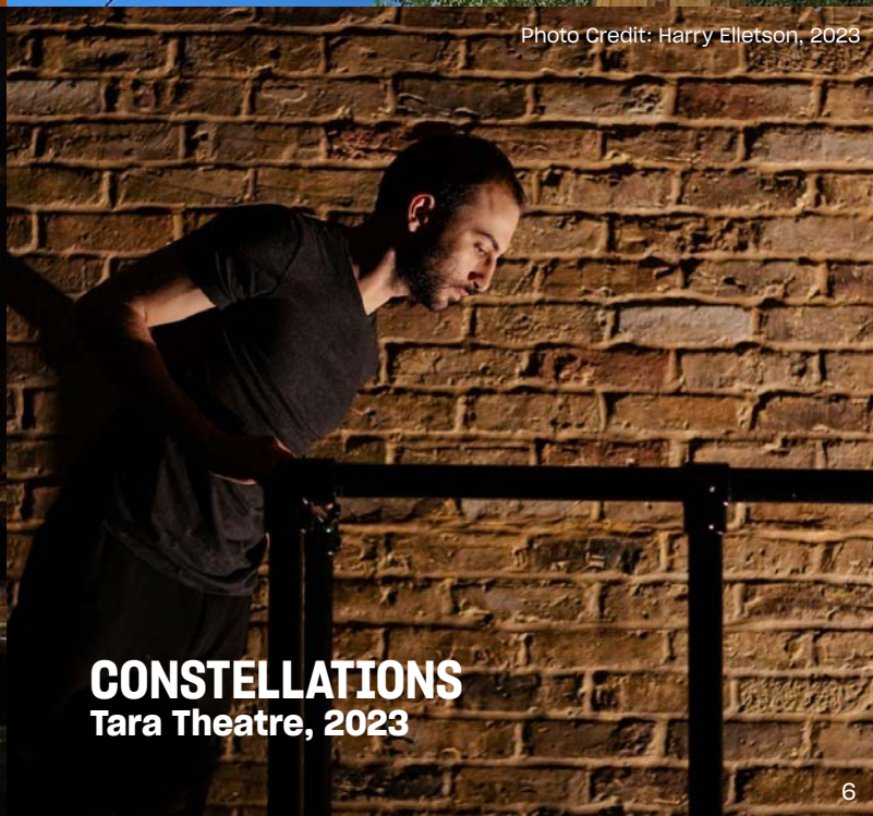
CONSTELLATIONS Tara Theatre, 2023